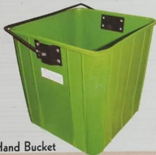
30 L Hand Bucket