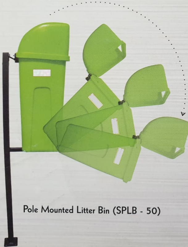
Pole Mounted Litter Bin (SPLB - 50)